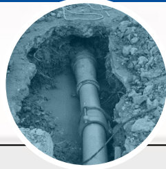
SEWER/SEPTIC LATERAL COVERAGE

Homeowner repair protection for leaking, clogged or broken water and sewer lines from the point of utility connection to the home exterior